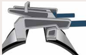
Patent Pending Cam Lug Fingers for Extended Range

Integrated Handle for ease of installation