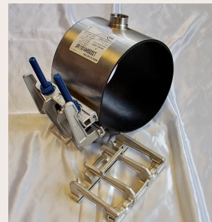
Optional Removable Lugs