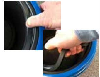
Use your thumb or other device to remove inner gasket layer.