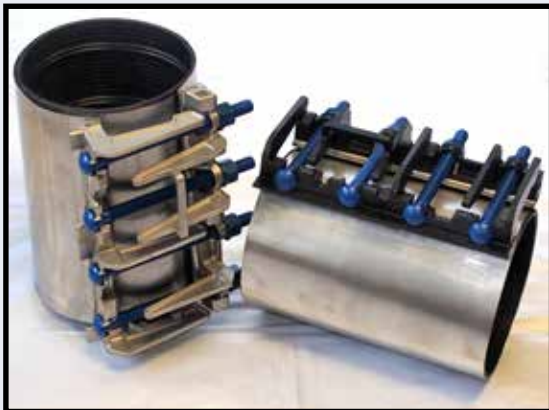
Quick-Cam Repair Clamps available in all stainless steel or optional E-Coated ductile iron lug system

The lugs may be easily removed to allow the clamp to be slid without difficulty under the pipe located in tight places. The lugs are available in either stainless steel or ductile iron, making the Quick-Cam clamp a competitive option to meet all field