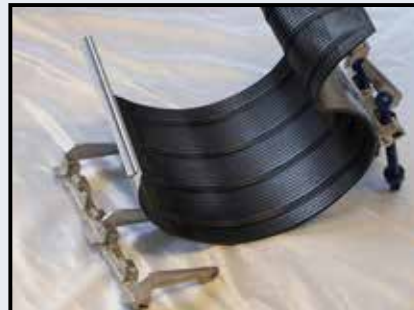
Clamp Lugs easily removed to allow clamp to be slid under pipe located in tight places.