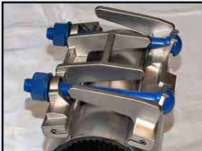
Integrated Handle for Ease of Installation

* Pressure rating, temperature rating, and bolt torque shown on the product label are the actual ratings of the individual product.